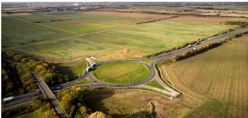
strategic and long-term investment to meet growth needs

In order for Greater Lincolnshire to realise its potential significant investment in infrastructure is required to tackle areas of inequality. These include focusing on enhancing digital connectivity, enabling access to work and addressing the causes of market failures in housing delivery and high-speed broadband roll out.